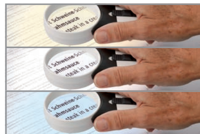
Even distribution of light in any situation – choice of 3 light temperatures.