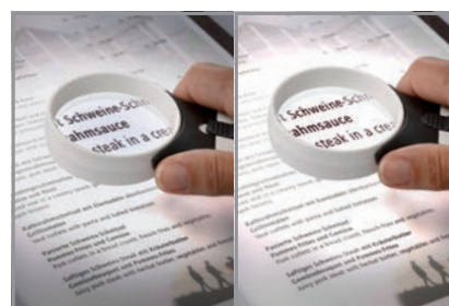
Extra bright lighting – the boost switch controls 2 brightness levels.