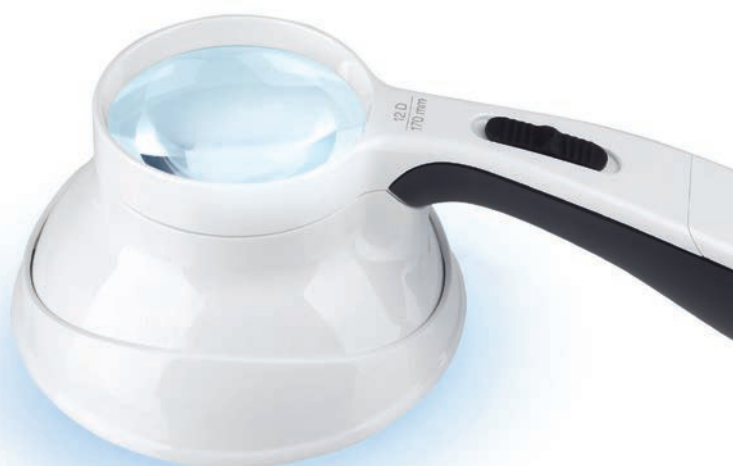
■ ERGO-Lux MP with ERGO-Base