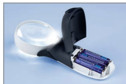
Easy battery replacement: open battery box by folding back the bottom shell of the handle.