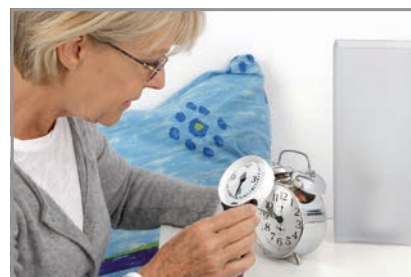
View finest details in a comfortable reading posture.