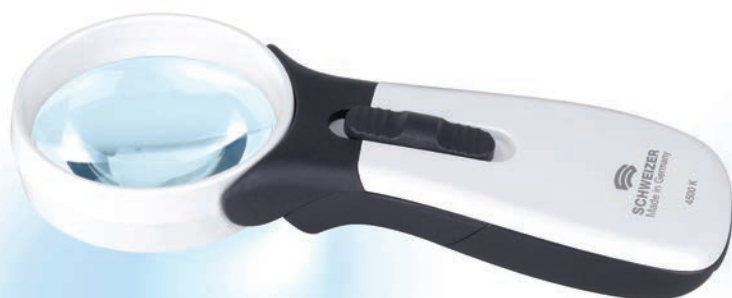
■ ERGO-Lux MP mobil